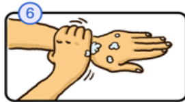
Focus on wrists

(From the Ministry of Health, Labour and Welfare website)