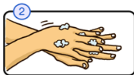
Overlap hands and rub