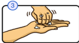
Rub tips of your fingers