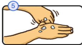
Focus on thumbs