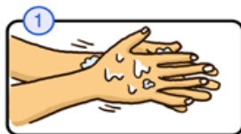
Water and Soap

Before washing hands: Shorten nails, take off watches and rings.